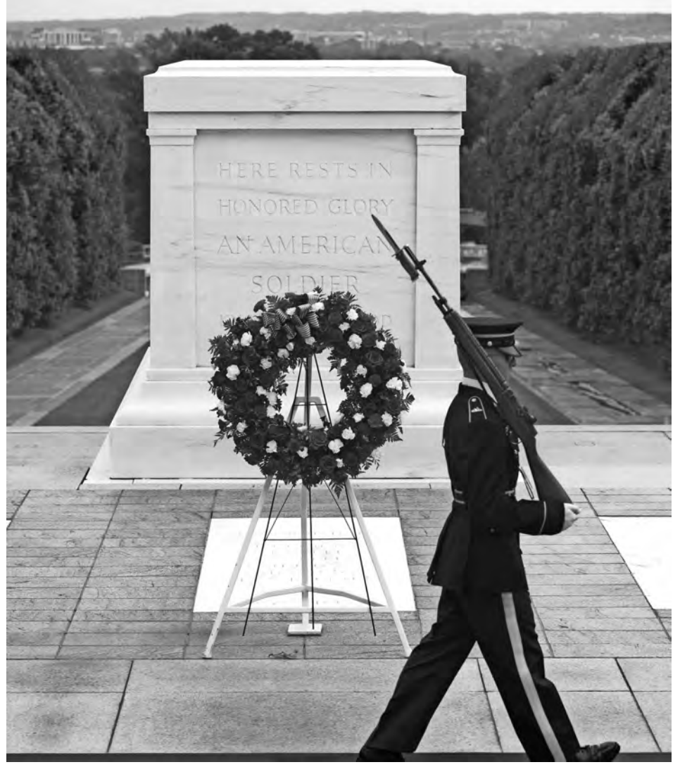
OLLI will offer a course on guarding the Tomb of the Unknown Soldier in December. Here, a soldier from the 3d U.S. Infantry Regiment (The Old Guard), Tomb Guard Platoon, goes past the Tomb of the Unknown Soldier sarcophagus and a recently laid wreath in Arlington National Cemetery, June 15, 2015, in Arlington, Va.