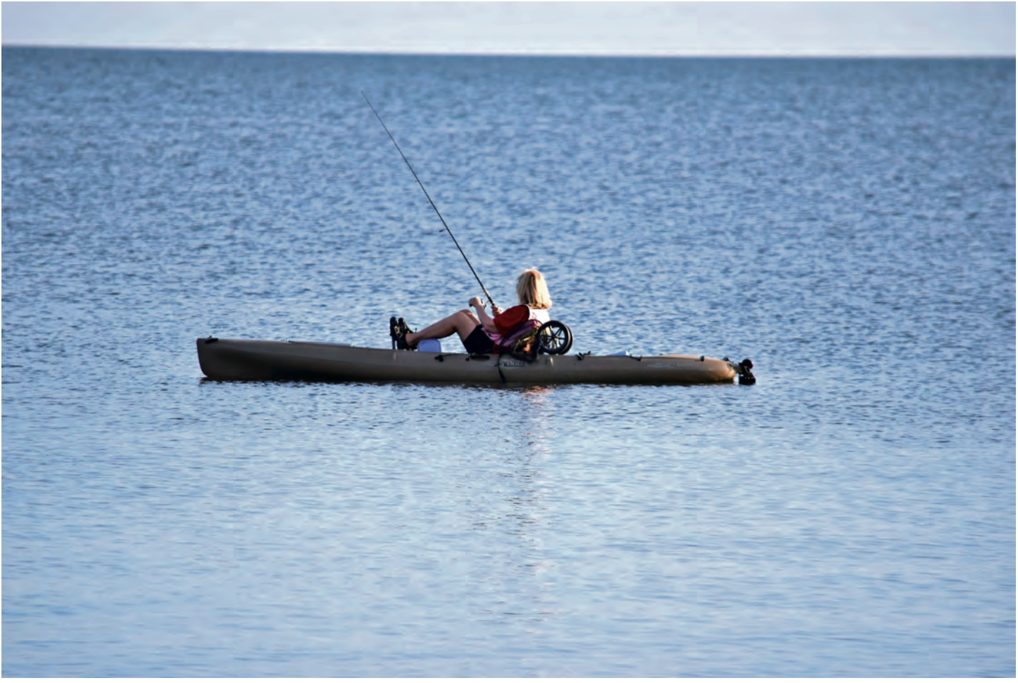
Maybe I will find my "flow" while fishing. It is OK if I don't catch anything. That's why they call it "fishing" and not "catching."

It is bittersweet to change directions at this point in my life. New communities were born, and friendships blossomed. Participants and staff became like family. I find comfort knowing there are people who will step in with new energy, creative ideas and an equal amount of passion. The Leon County