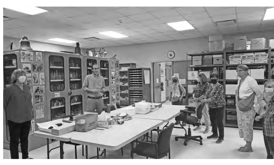
Florida Archaeological Collections houses over half a million artifacts representing over 12,000 years of human occupation in Florida.

The 12th Annual L3X – Lifelong Learning Extravaganza delivered 45 opportunities for adults in our community to EXPLORE, EXAMINE, and EXPERI-ENCE arts, culture, history, nature, and science through classes, tours, and field trips. Though L3X happens during the month of September, the fun continues year-round with a variety of Lifelong Learning classes offered each month. Check out page 2 for what classes are in store during the months of November and December through the Tallahassee Senior Center.