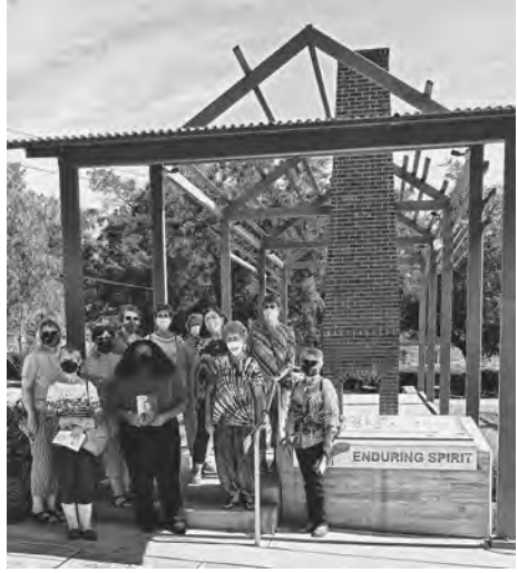
L3Xers tour the Sleepy Hollow exhibit as well as the historic Riley House, representing the thriving black neighborhood that once existed just east of downtown Tallahassee.