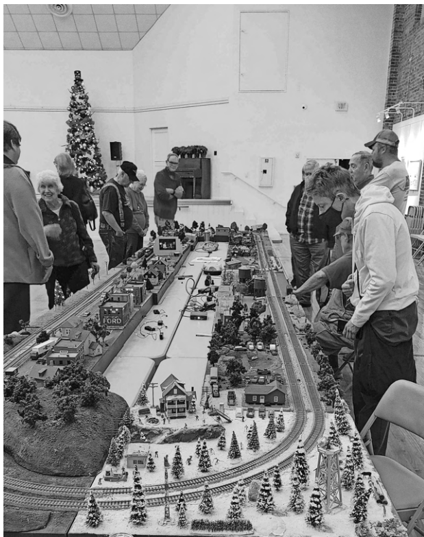
Young and old enjoy the model train displays at the Senior Center by the Big Bend Model Railroad Association in December.