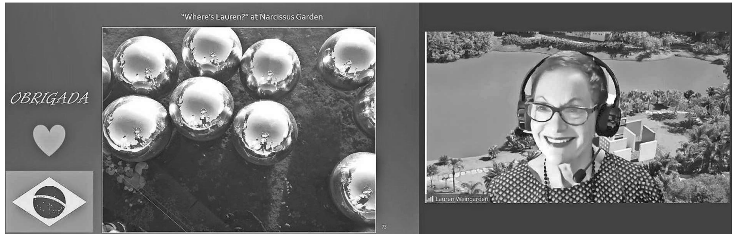
OLLI Special Lecture Series - Inhotim an Art Museum as Paradise, presented by Lauren Weingarden.

The digital Course and Activity schedule will appear in mid-January at olli.fsu.edu . The Showcase of Classes, a