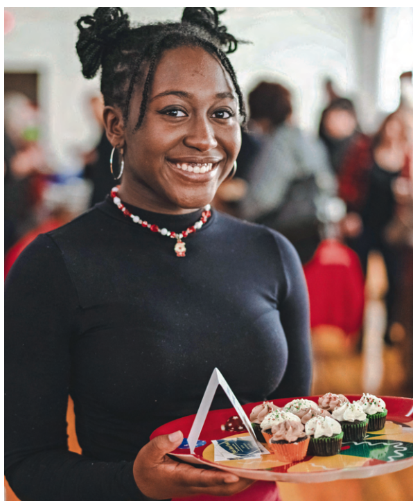
Cupcakes were sponsored by Centre Pointe Health & Rehabilitation at the Deck the Halls event.